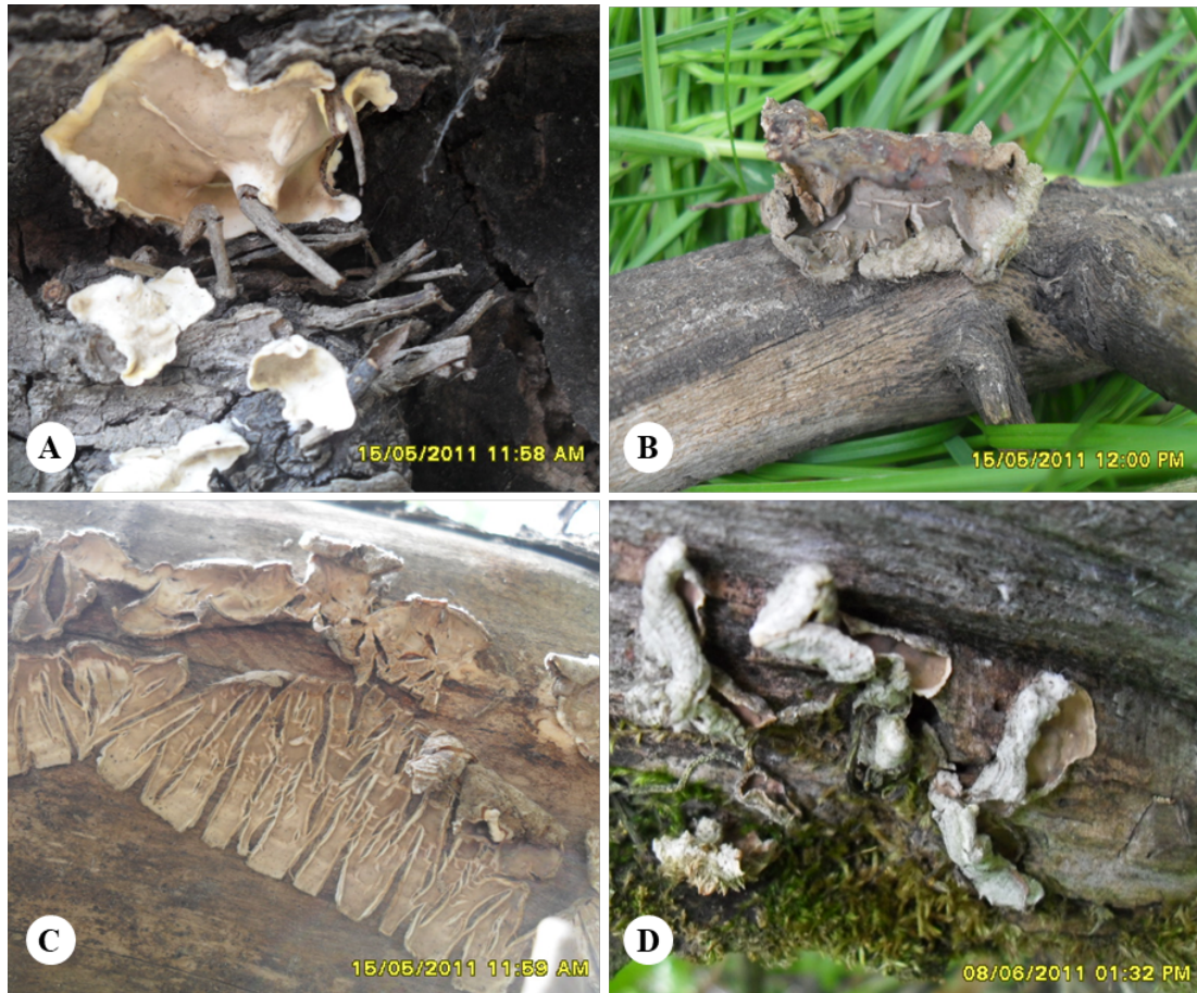
Figure 1. Basidiomata showing variation in color and morphology. (A, B) Basidiomata on Acer tataricum subsp. semenovii (Regel & Herder) A.E. Murray, voucher YG-030; (C) basidiome with concentric ridges and a prominent crack on the same host tree, voucher YG-056; (D) hymenial surface associated with algal growth and bryophytes on unidentified fallen wood, voucher YG-048.

From a practical field perspective, the most useful diagnostic combination includes thin, tough, shelf-like basidiomata; a conspicuously hairy and zonate upper surface; a smooth, yellowish to orange hymenial side; and regular occurrence on dead branches, trunks, and exposed hardwood surfaces. This distinctive morphology likely explains why the species is repeatedly recognised and assigned vernacular names in different linguistic traditions, even though direct medicinal-use documentation remains relatively limited (Breitenbach & Kränzlin 1986, Bernicchia & Gorjón 2010, Gafforov et al. 2023a).